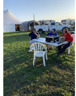
State Senator Chapin Rose