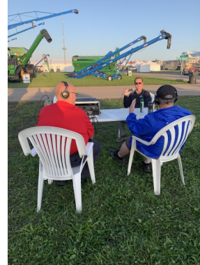
Congressman Rodney Davis

We did get the opportunity to wander around the grounds and marvel at the size of today's farming equipment. Yes, there were tractors and combines to wow the exhibitors but there was so much more to see. There was everything from hand tools to pole barns to grain bins and even a house for visitors to stop and look at. Occasionally, you would just stop and stare at some behemoth of a machine and try to figure out what it was and what in the world you would use it for. One of those machines turned out to be a machine that was used in cleaning sludge out of lagoons.